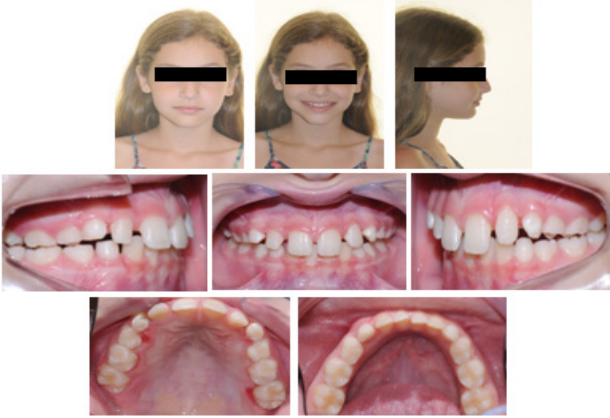
Figure 4 – Photographs of the facial and intraoral post-treatment

Patient follow-up was carried out monthly. She presented normal transversal condition after six months of the retention phase of RME. The Expander was removed from the patient after this period. (Figure 4)