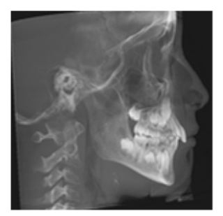
Figure 5 – Initial and final features

The cephalometric analysis performed showed the patient's ANB value changed, from 5.3° to 5.8°. Nasolabial angle also increased 5.8°. (Table 1) (Figure 5).