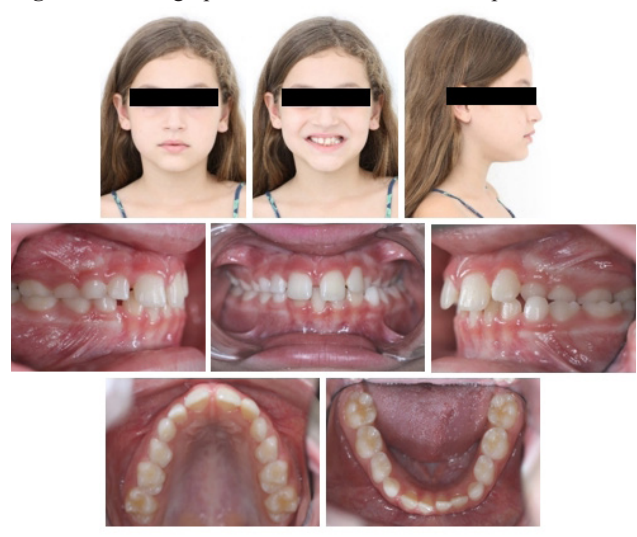
Figure 1 – Protographs of the facial and intraoral pre-treament

The shape of the upper arch presented a higher transversal constriction in the intercanine width than the intermolar width. The presence of diastemas and deep palate could be observed. (Figure 1)