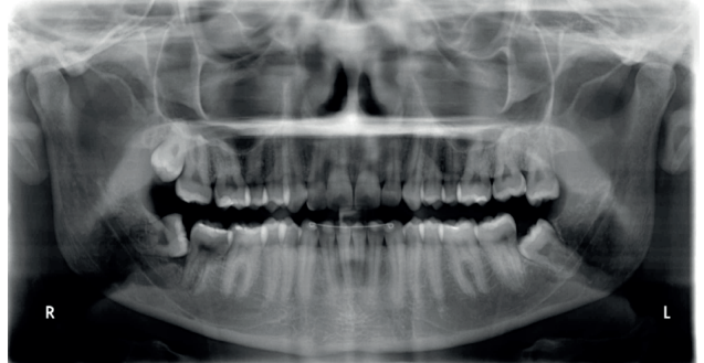
Figure 1- Preoperative panoramic radiographic

upper and lower third molars, the left lower third molar was mesioangular, 2C according to the classification of Pell and Gregory (Figure 1).