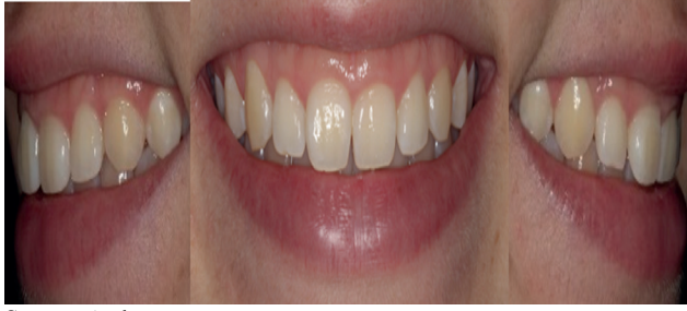
Figure 1 - Initial clinical appearance

A caries-free, 20-year-old female patient attended the Piracicaba Dental School (University of Campinas, Piracicaba, São Paulo, Brazil) with esthetic complaints about her smile and the shape and color of her anterior teeth (Figure 1). The patient's history showed previous orthodontic treatment and no extractions. The clinical examination revealed a gingival smile, fluorosis, short teeth, the unit 11 not aligned with the dental arch, different coloration of the canines in comparison with the others and residual orthodontic luting agents. As part of the examination, an impression was made using an alginate material (Hydrogum 5; Zhermack, Badia Polesine, RO, ITALY) for the reproduction of plaster models. Additionally, a diagnostic waxup was done on the maxillary arch model (Figure 2).